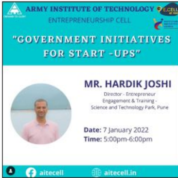
Government Initiatives for Start-ups