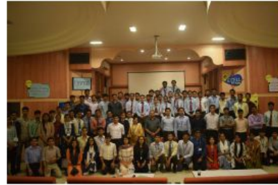
Enthusiastic Participants and Supportive Organizers