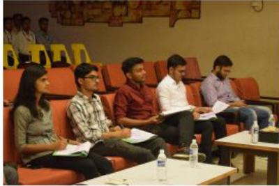
Judging Panel deducing the originality of pitch