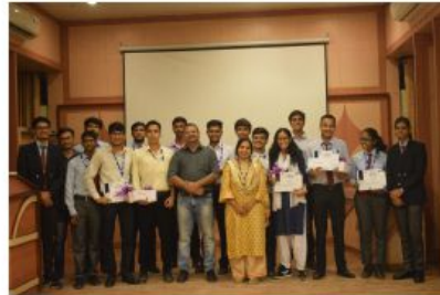
Judging Faculty and the Winning Teams