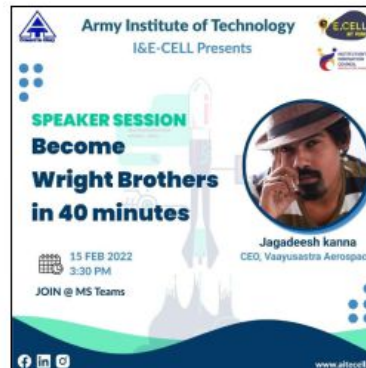
Become Wright Brothers in 40 minutes

“When you talk, you are only repeating what you already know. But if you listen, you may learn something new.” -Dalai Lama