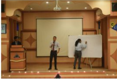
Teams presenting their solution to the real-life problem