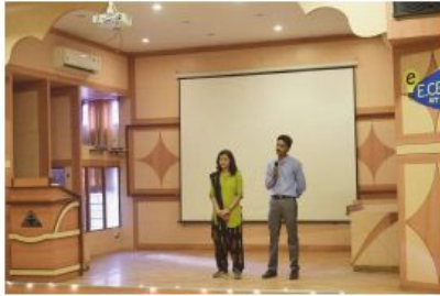
Team selling their randomly picked product