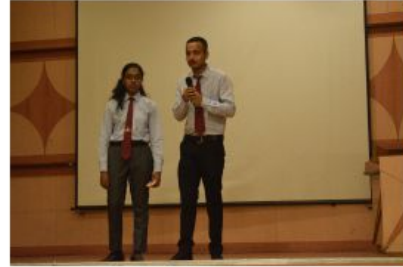
Team delivering their pitch for their product

“ Make my mind was a consumer-based contest that evaluated participants' optimism, originality, and imagination in order to select teams for the second phase. ”