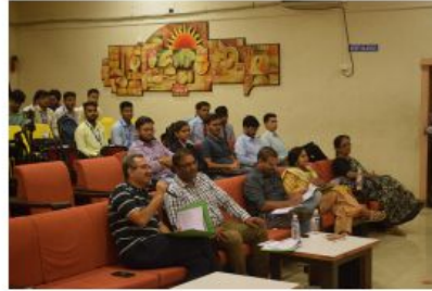
Jury cross questioning the presented solutions

In this round, qualified teams had to solve a real-life problem situation while holding the position of CEO of a company or organisation in crisis.