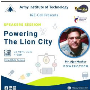
Powering the Lion City