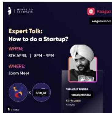
How to do a Startup?

“When you talk, you are only repeating what you already know. But if you listen, you may learn something new.” -Dalai Lama